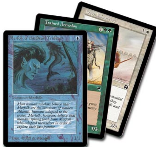
Savannah Lions aside, several vanilla creatures have found their way into competitive decks.